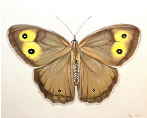
24 x 36, Butterflies, Oil Paint $400