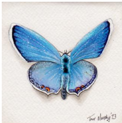
4 x 4, Framed Butterflies, Pen & Ink $40