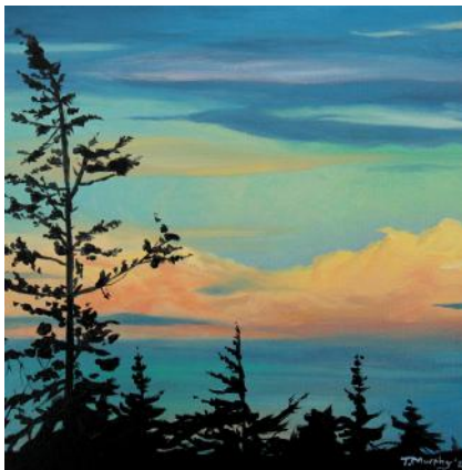
10 x 10, Landscapes, Oil Paint $200